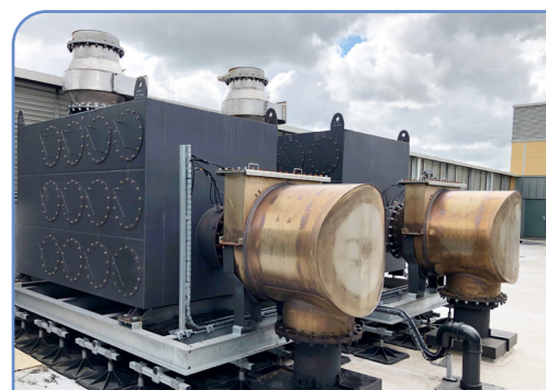
The SCRonF units brought emissions well within regulatory limits.