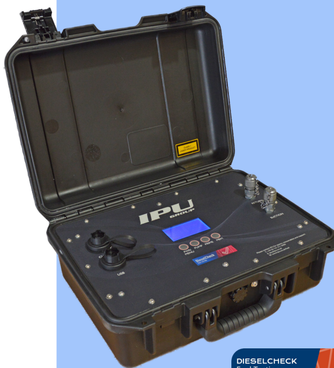
DIESELCHECK Fuel Testing